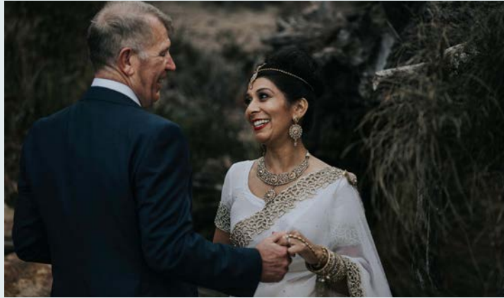
HEMU + ALBERT | Saffire, Freycinet