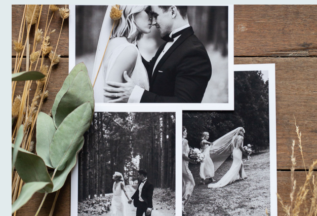
Fine Art Prints