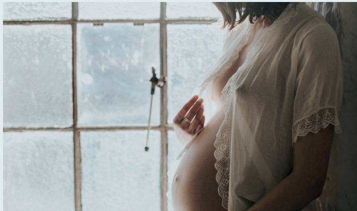
SKYE | Pregnancy Portraits Click here to view