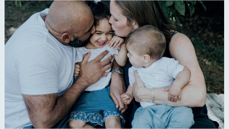
KHAN FAMILY | Hobart, Tasmania Click here to view